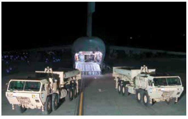
An Air Force C-17 delivers the first two Terminal High Altitude Area Defense (THAAD) launchers to Osan AB, South Korea, in March.

The deployment came the same day North Korea launched four ballistic missiles into the Sea of Japan. Defense Secretary James N. Mattis and Japanese Minister of Defense Tomomi Inada agreed "that these launches are an unacceptable and irresponsible act" that undermines stability in the region, according to a Pentagon statement.