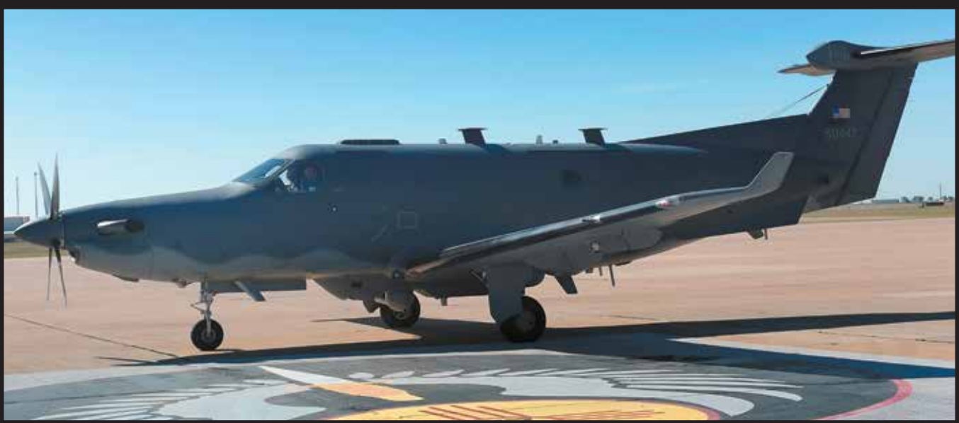
A 318th Special Operations Squadron U-28A aircraft at Cannon Air Force Base, N.M., in 2013.