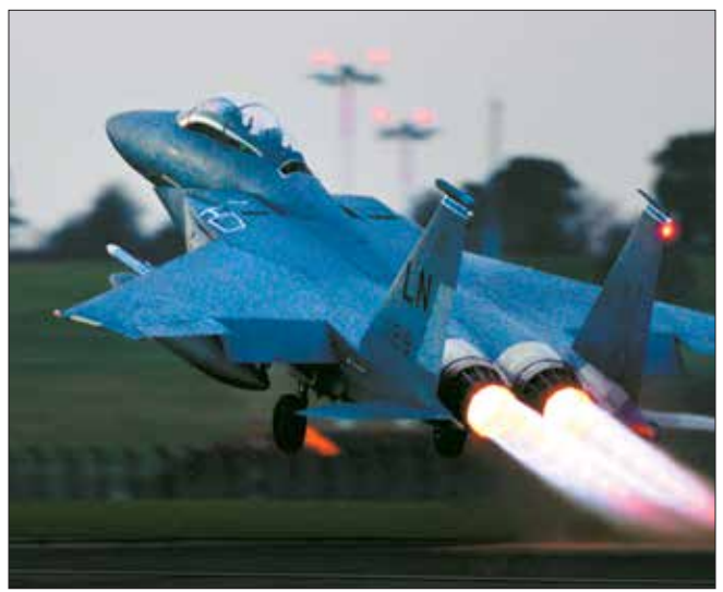
An F-15E takes off from RAF Lakenheath, UK, in February.